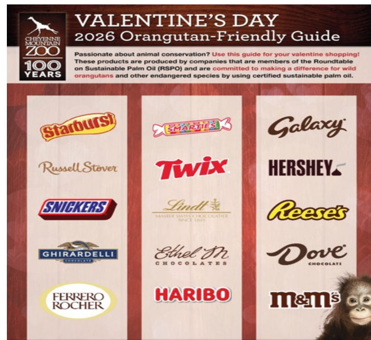
Valentine's Day Shopping Guide

Download the PalmOil Scan app to learn if the company is committed to sourcing sustainable palm oil.