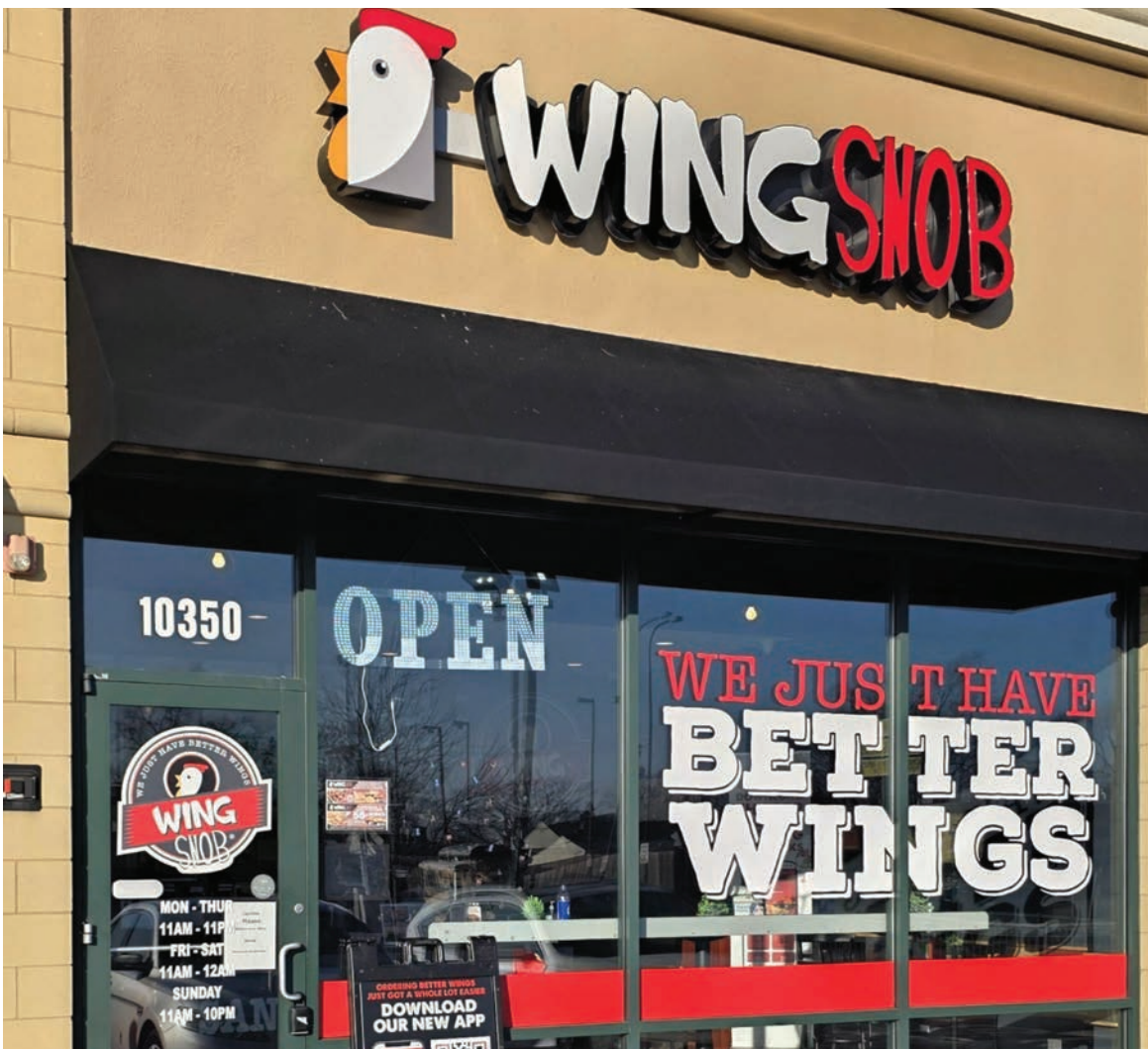
While the name "Wing Snob" may spark curiosity, the owners are clear about what sets the restaurant apart. The food is never frozen, made with fresh, halal meat, and carefully prepared and marinated in-house.