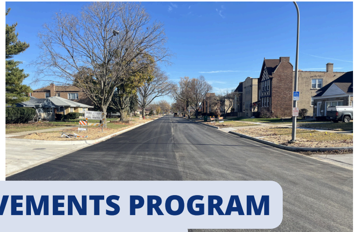
WATER MAIN IMPROVEMENTS PROGRAM RECEIVED $200,000 IN GRANT FUNDS