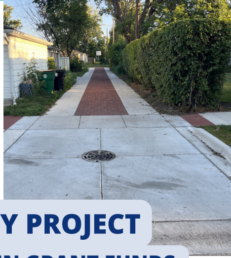
GREEN ALLEY PROJECT RECEIVED ~$70,000 IN GRANT FUNDS